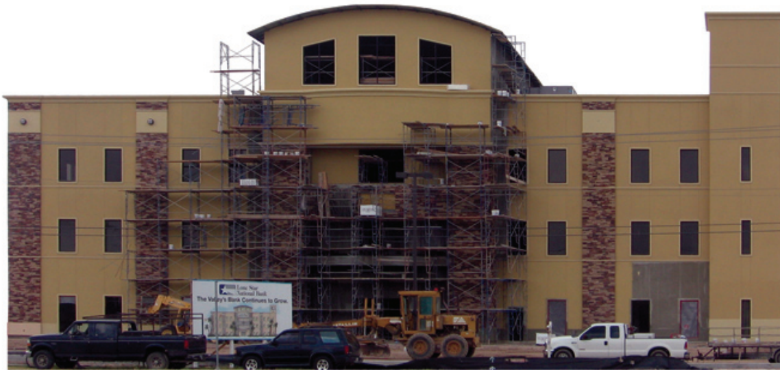
Lone Star National Bank Corporate Office is currently under construction on Nolana, near the corner of McColl, in McAllen. It is scheduled to be completed by Summer 2009.